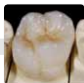
Fully anatomical, stained and glazed