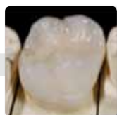
Fully anatomical, glazed