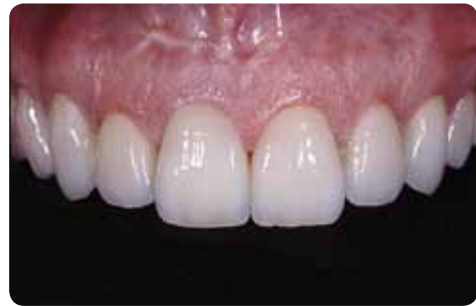
Complete dentures with IPS e.max Press Prof. Dr D. Edelhoff / O. Brix, Germany

Select, in cooperation with your laboratory, the suitable solution for the respective patient case: a cost-effective, fully contoured restoration as an economical and appealing alternative to a full cast crown. Or you can choose the more exclusive version fabricated by means of the cut-back and layering technique, which will meet even the most exacting esthetic requirements of your patients.