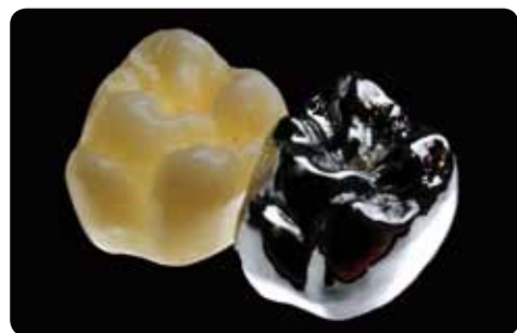
IPS e.max Press crown compared to a full cast crown W. Weisser, Germany